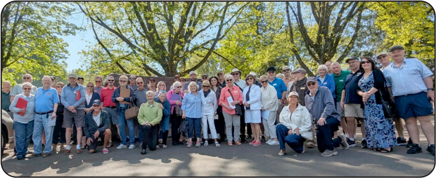
Drivers and navigators at the Drive It Day start.

Fifteen MGs and eleven Jaguars started at the Fort Langley Historic Site and took a drive of 30 miles on the roads around the Glen Valley to celebrate “Drive It Day”. The CCMGC and CXKJR members were joined by various cars from the Langley Mostly British Motoring Club and the Old English Car Club, including a Sunbeam Alpine, an Austin Healey, a Triumph TR8, a Lotus Elise, a Jensen, and a Rover 2000TC. The Classical Gas editor drove in a BMW Z3 as her MGB Roadster was awaiting parts.