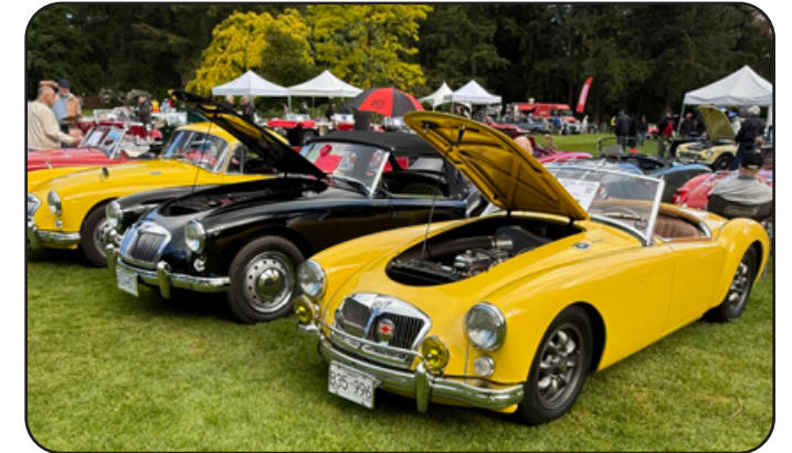
The ever-popular MGAs.