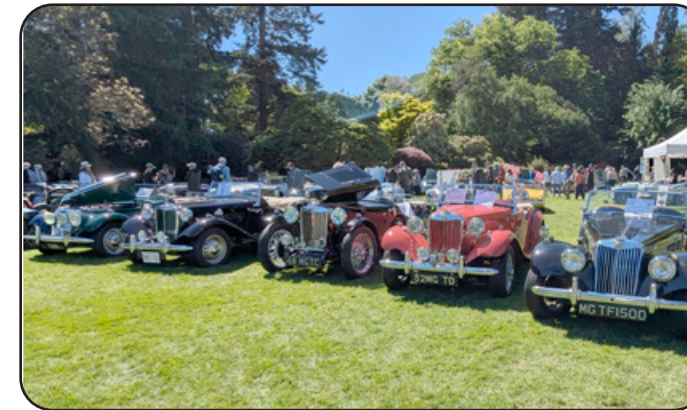
MG T-Series: TC, TD, TF.