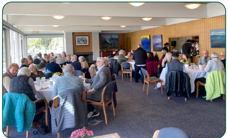
Lunch at the West Vancouver Yacht Club.