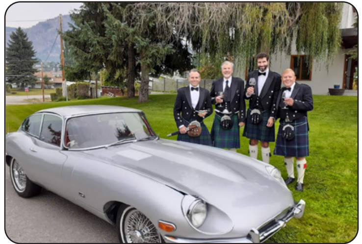
Wedding car in Lake Country.

So ... Don't let “One-Day-Itis” or “Round 2 Itis” take hold of your life, get out and go. Book a flight to the UK ... Barcelona; start a second family; get creative; live, love and drink quality wine.