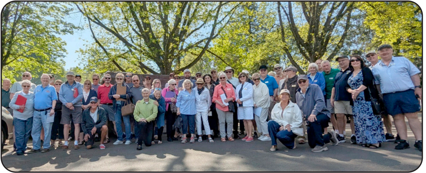
Drivers and navigators at the Drive It Day start.

Fifteen MGs and eleven Jaguars started at the Fort Langley Historic Site and took a drive of 30 miles on the roads around the Glen Valley to celebrate “Drive It Day”. The CCMGC and CXKJR members were joined by various cars from the Langley Mostly British Motoring Club and the Old English Car Club, including a Sunbeam Alpine, an Austin Healey, a Triumph TR8, a Lotus Elise, a Jensen, and a Rover 2000TC. The Classical Gas editor drove in a BMW Z3 as her MGB Roadster was awaiting parts.