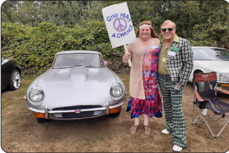
1960's party at the Newby's in Aldergrove.

Few of us escape it and if we honestly took a realistic audit of our own garages/workshops, along with the cornucopia of tools and unfinished (or unstarted) projects, we would recognize the symptoms.