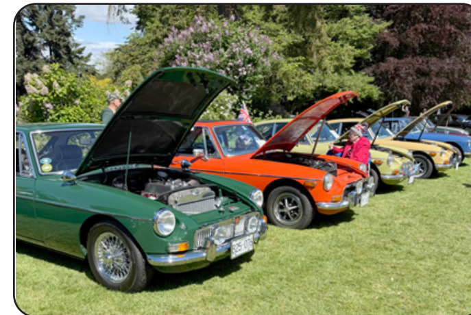
A colourful chorus line of MGB GTs.