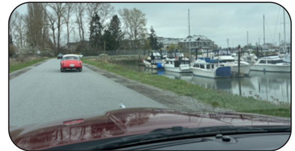
The scenic route passed by Steveston Harbour.