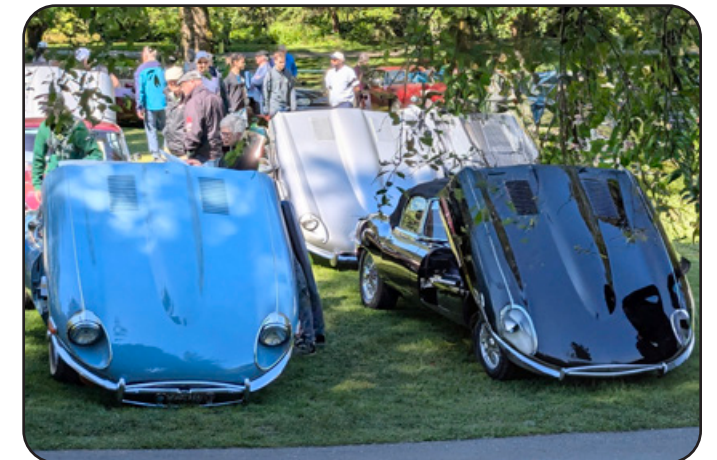
E-Types are always crowd pleasers.