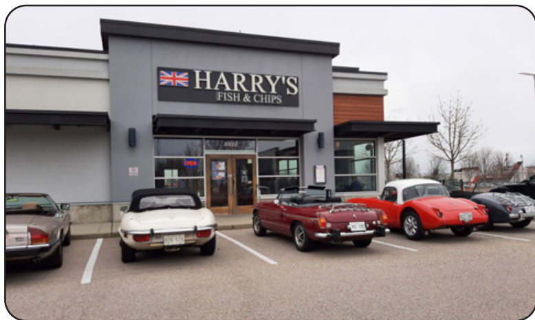
A variety of MGs & Jaguars at Harry's.