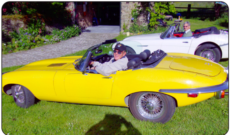
Heading to Normandy in France.

For most of us “Britcar Nuts” an honest look in the mirror will let us know that being north of 65 ... ok ... 75, has its complications. The days Continued on page 20