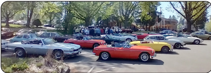
Cars gathered at the Fort Langley Historic Site.

Fifteen MGs and eleven Jaguars started at the Fort Langley Historic Site and took a drive of 30 miles on the roads around the Glen Valley to celebrate “Drive It Day”. The CCMGC and CXKJR members were joined by various cars from the Langley Mostly British Motoring Club and the Old English Car Club, including a Sunbeam Alpine, an Austin Healey, a Triumph TR8, a Lotus Elise, a Jensen, and a Rover 2000TC. The Classical Gas editor drove in a BMW Z3 as her MGB Roadster was awaiting parts.