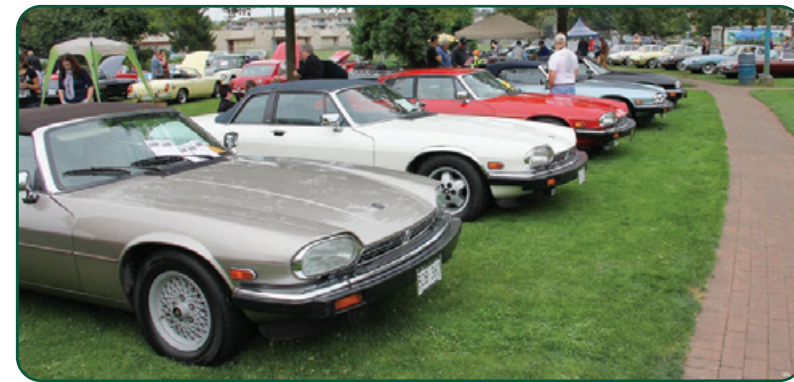
The Heritage Classic show at Douglas Park in Langley.