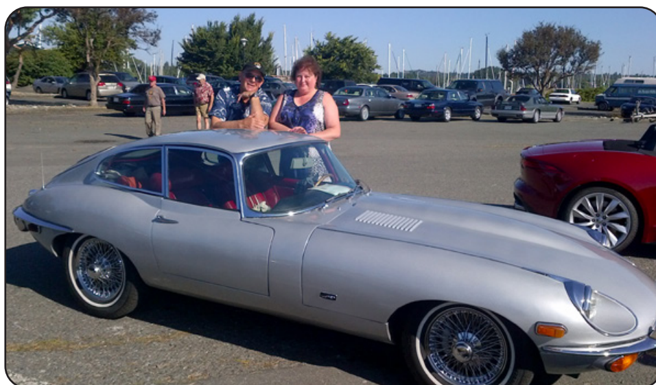
Jaguars on the Island Rally start.