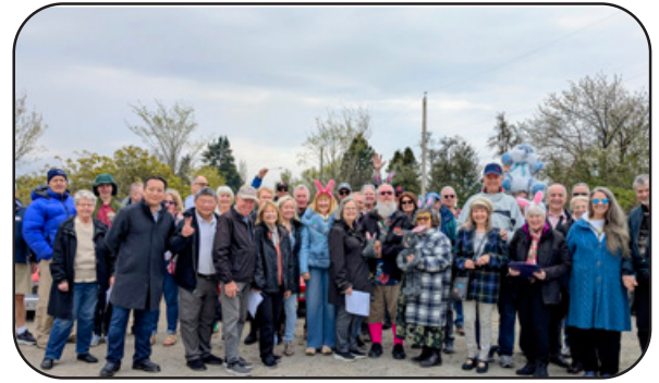
The start at Terra Nova on the Fraser River.

See you next year!