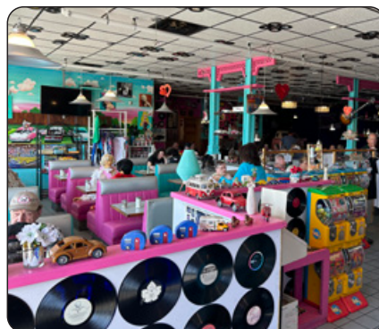
Brogan’s Diner in Langley.

“Drive It Day” has evolved from “Drive Your MG or Jaguar Day”, which became a Club event after “Drive Your MGA Day” on the first Saturday of May was declared by the North American MGA Register (NAMGAR) many years ago. An event with the same moniker was held on April 26 in England this year.