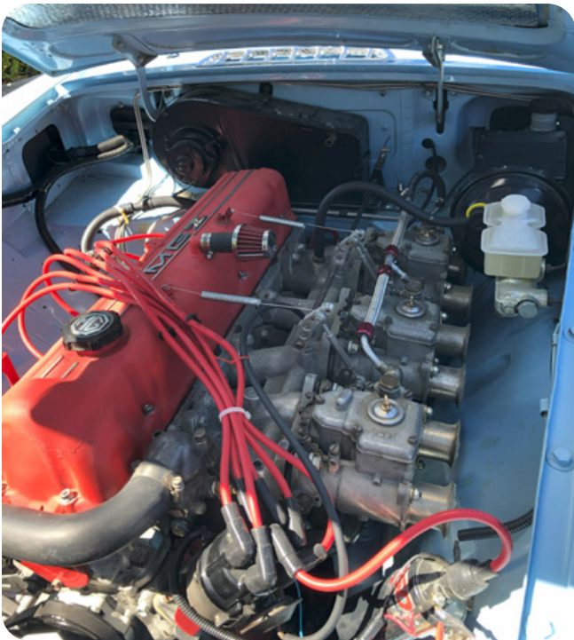
Engine arrangement in the MGB.