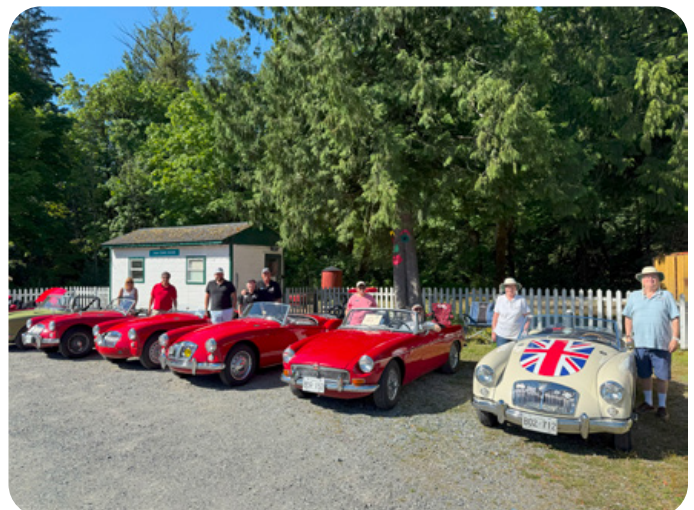
CCMGC’s submission to the GoF West Virtual Event.