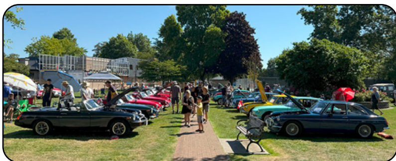
MGBs and MGB GTs bring out the crowds at Douglas Park.

there were Heritage participants from 8 other car clubs in BC and Washington.