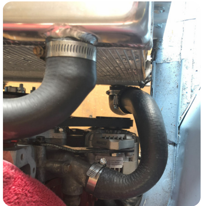
The offending alternator and fan belt.