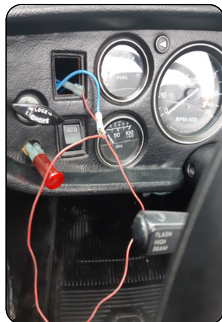
The roadside fix on the Lawrence MGB "Morris".