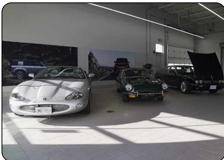
Three CXKJR cars in the dealership breezeway.