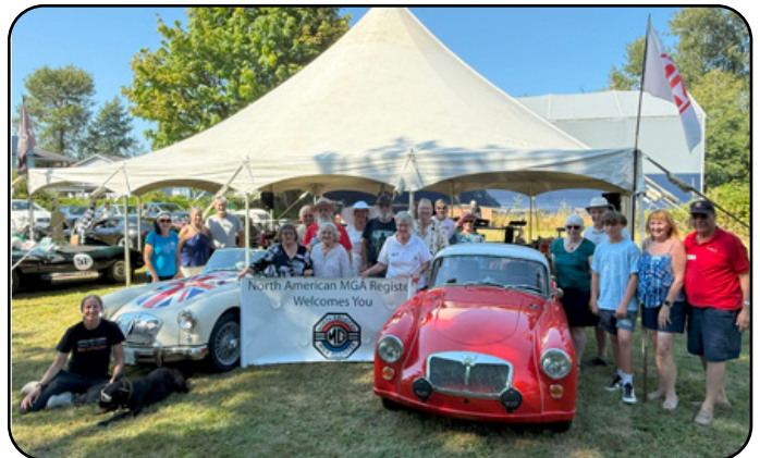
Some of the Revival participants with the North American MGA Register banner.