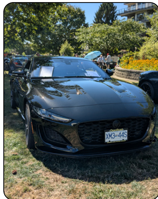
Ian & Doreen Newby's 2024 F-Type FHC scored a perfect 100.00 in the Champion F Class.