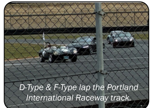
D-Type & F-Type lap the Portland International Raceway track.

We met many old friends and made many new ones. Weather was cool with some showers. We will do it again. There used to be a large Canadian Contingent, not so this year.