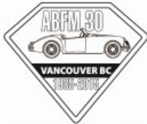
ABFM 30th Anniversary Dash Plaque