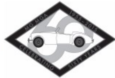
60th Anniversary Grille Badge