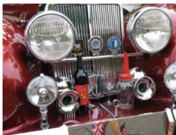
Best of Show 2015 !